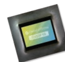
Image Sensor Expands Family for Automotive Viewing Cameras with Higher 3MP Resolution and Added Cybersecurity

OMNIVISION's OX03F10 image sensor expands our next-generation ASIL-C viewing camera family with higher 3MP resolution and cybersecurity features that are required as vehicle designers make the transition from Level 2 and 3 advanced driver assistance systems (ADAS) to higher levels of autonomy. The OX03F10 also maintains the family's unique combination of a large 3.0 micron pixel size with a high dynamic range (HDR) of 140 dB and the best LED flicker mitigation (LFM) performance for minimized motion artifacts. Additionally, the sensor is offered in a 1/2.44" optical format and features a 4-lane MIPI CSI-2 interface.