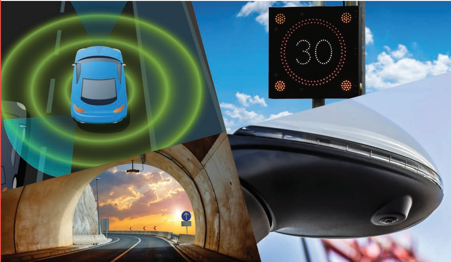
Image Sensor for Automotive Viewing Cameras with 140 dB HDR and Top LED Flicker Mitigation Performance